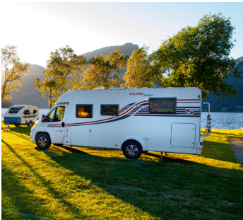
Use in motorhome