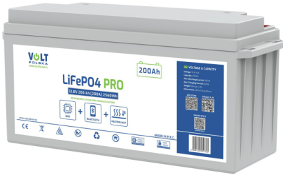
LifePO4 battery 12,8V 200Ah (200A)